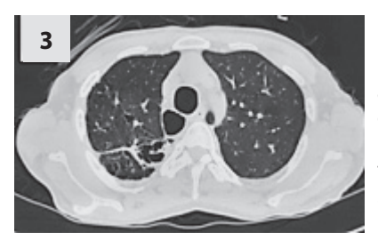
FIGURE 3. Chest computed tomography, axial view revealing bilateral cystic bronchiectasis presenting mainly in the right middle and lower lobe and also dilated trachea (>4 centimeters) and bilateral main stem bronchi diverticula emerging from the intrathoracic trachea.