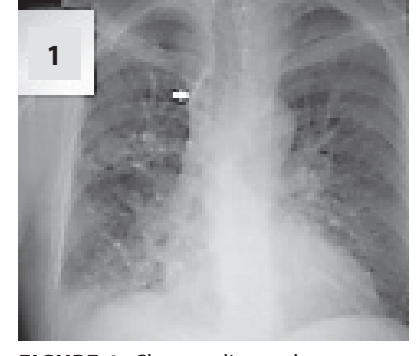
FIGURE 1. Chest radiography posteroanterior view revealed right paratracheal lucency, reticular dense areas and cystic lesions mostly in the right middle and lower zones and ill defined opaque regions.

A 65 year old male, nonsmoker was admitted into the Pneumology Department with the complaints of productive cough, dyspnea, chest pain and fatigue. He is a known patient, under treatment for chronic obstructive pulmonary disease. Over the years he had multiple lower respiratory tract infections. Physical examination showed bilateral inspiratory crackles and turgid jugular veins. Purulent sputum was analyzed and Pseudomonas aeruginosa was isolated. Blood analysis came normal. Spirometry test showed forced expiratory volume in the first second 35%, forced vital capacity 44% and tiffeneau index of 79. Arterial blood gases showed hypoxemia and hypercapnia with respiratory acidosis. The patient received nasal oxygen at 1.5 liters/minute, bronchodilators, antibiotics associated with mucolytic treatment and physical rehabilitation therapy<sup>1</sup>. Pneumococcal + flu vaccination, regular follow-up visits were suggested. After 14 days, the patient was discharged and has been doing well since.